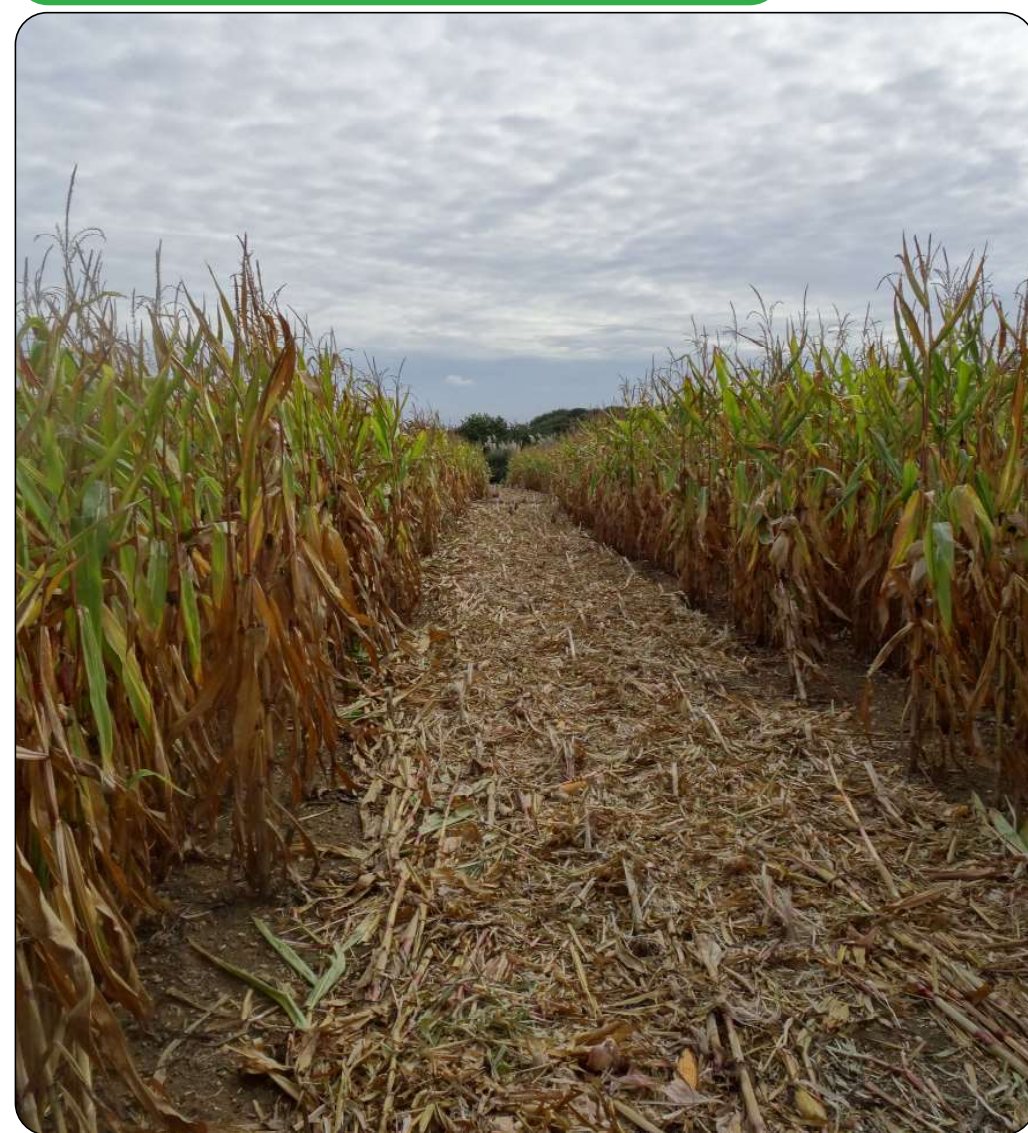
Red & White Millet - Excellent game cover crop which can also be used to enhance maize. It produces good, low cover for partridges and pheasants with the seed heads providing food.

Japanese Reed - Stronger and a more winter hardy member of the Millet family. Good cover and feed crop.