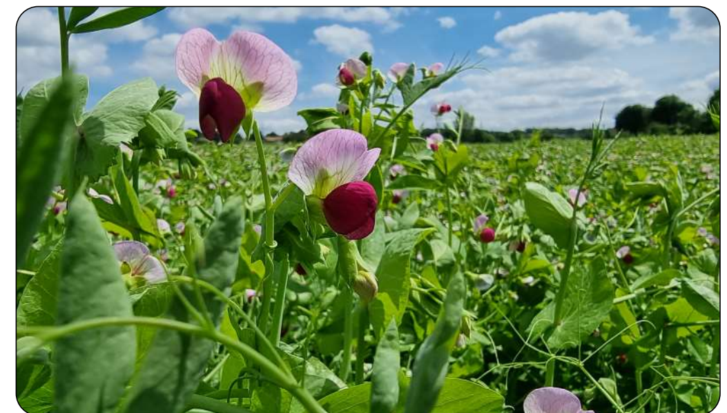
Swift - This semi-leafless maple pea yields higher and is easier to harvest than existing varieties. Swift is an established variety for the pigeon trade.

Minerva - This is a Church of Bures variety. A purple flowered, brown skinned pea which produces high yields, early to mature with seed of good shape and colour. It is still the preferred variety for feeding to pigeons which makes it a valuable commodity. It is also ideal in various green forage and silage mixtures. The browned seeded peas can be sold into the feed market for grinding and inclusion into animal feed. Its popularity has increased steadily over the years due to its value to organic farmers as green manure or as a deep rooting full foliage legume.